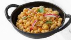
بليلة Chickpeas Balila

Chicken Pesto with Artichoke Hearts and Shoestring Fries.