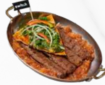
كباب خشخاش Kebab Keshkash

Grilled Arabic bread stuffed with Switch™ minced meat, and parsley