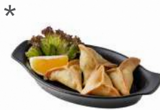
فطائر بالسبانخ Fatayer spinach

Crispy meat, and bulgur shell stuffed with a delicious filling of minced meat, pine nuts, and crushed wheat.