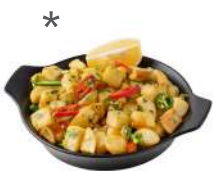
بطاطا حرة Spicy Potato Cubes

Crispy Fried Potato Cubes Mixed with Freshly Chopped Coriander, Green and Red Chili, and a Hint of Garlic