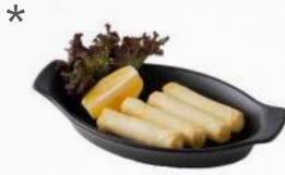
رقائق بالجبنه Cheese Rolls

White cheese with a touch of parsley wrapped in thin dough