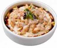
طاجن قريدس بالحصرم Tajin Shrimps Bil Husroum

Tajin, almond fried, olive oil, marinated shrimps, and pomegranate molas.