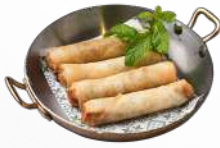
رقاقات شنكليش Shanklish Rolls

Shish barak samak, yoghurt, tahini sauce, fresh coriander, fresh garlic chopped, butter, and pine seeds.