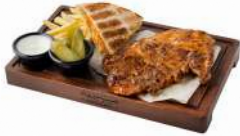
نصف فروج Grilled Baby Chicken 1/2

Grilled lamb minced, and served on skewers