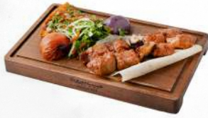
لحمة حبيب مشوية Habib's meat skewers

Veal fillet cubes marinated & grilled on skewers