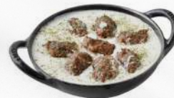
كباب باللبن Kebab Yogurt

Lamb fillet cubes marinated & grilled on skewers