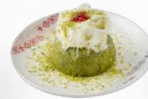
مفروكة قشطة مع فستق Mafrouket Ashta with Pistachio

Mafroukeh dough topped with ashta, and honey