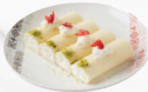
حلاوة الجبن Halawet El Jibne

Assorted plate of baklava made with paper-thin dough, and various fine nuts