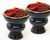
تغيير الراس Head replacement

Two apple (Nakhla), grape, grape/mint, lemon/mint, mint, melon, sweet melon, Gum, Gum/Sweet melon, Gum/mint, cinnamon/Gum,apple/mint/, berries, rose, blue mist, berry/grape