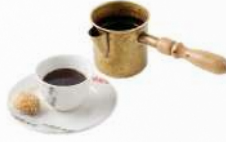
قهوة لبنانية Lebanese coffee