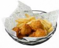
دجاج طاووق كريسيه Crispy Taouk

Deep-fried breaded taouk served with fries and cocktail sauce