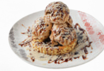
تارت ديس بطحينة Tarte Debes Bil Tahini

Ashta cream wrapped in sweet cheese and semolina