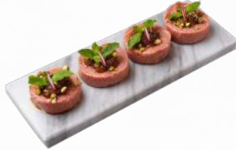
كبة حبيب بيروت Kebbeh Habib Beirut

Raw meat Kebbeh, special Habib Beirut Sauce, truffle oil, and pistachio.