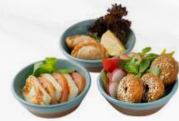
تشكيلة مازة حبيب Habib's Mezza Mix of 3

Spicy sausages slices sautéed with tomato sauce, green and red bell peppers.