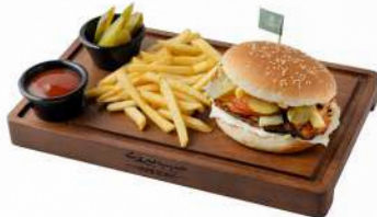
برغر دجاج علمة الطريقة اللبنانية Lebanese Chicken Burger

Cooked chicken with pan-fried onion mixed with sumac powder, all rolled in grilled Saj Bread served with fries, and yogurt dip