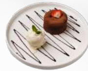
حبيب شوكولا فوندان Habib's chocolate Fondant

Melted cheese drizzled with sugar syrup, and fresh kaak