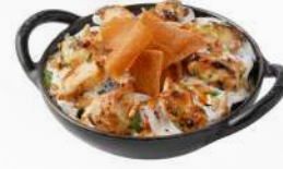
فتة دجاج Chicken Fatteh

Fried eggplant chunks, smothered with warm yogurt & topped with fried bread and pine nuts