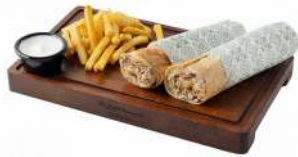
شاورما دجاج Arabic Chicken Shawarma

served with biwaz, tomato, onion, tarator, garlic paste, pickles, and fries in Saj bread