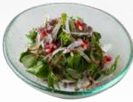
سلطة بانجان Eggplant salad

A mix of rocket leaves, beetroot, onion, and sumac with lemon oil dressing