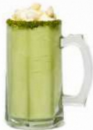
ستريت أفوكادو Street Avocado

Freshly blended avocado with milk, Topped with Ashta, Almonds and Honey