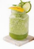
ليمون بالنعناع Fresh Lemonade with Mint