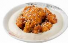
حمص بالقرنبيط Cauliflower Hummus

A bowl of Hummus topped with meat, and pine nuts