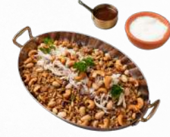
برغل بالدجاج Burgul 3a Djeiz