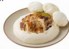
حمص بالشاورما دجاج Hummus With Chicken Shawarma

Grilled halloumi sliced, accompanied by slices of tomato