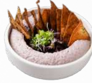
حمص بالترافيل Hummus Truffle

Tajin, almond fried, olive oil, marinated shrimps, and pomegranate molas.