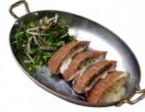
كبة جبنة Kebbeh Bi Jebneh

Meat kebbeh dough, stuffing mix cheese, pistachio crushed, and biwaz.