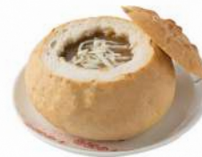
شوربة البصل Onion Soup

All Prices are in AED and include VAT Charges