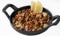
لحمة راس عصفور Meat Ras Asfour

Crispy Fried Potato Cubes Mixed with Freshly Chopped Coriander, Green and Red Chili, and a Hint of Garlic