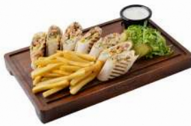
شاورما دجاج عربي Arabic Chicken Shawarma

Meat shawarma with biwaz, tomato, Onion, parsley, and tarator sauce