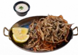
بزرة (موسمي) Bizreh (Seasonal)

Pan fried clean birds, served in Molasses sauce