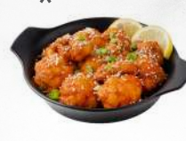
قربيط بالسمسم Arnabit Bil Semsoum

Homemade baby sausage with pomegranate sauce, and pine nuts