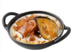
فتة باذنجان Eggplant Fatteh

Fried eggplant chunks, smothered with warm yogurt & topped with fried bread and pine nuts