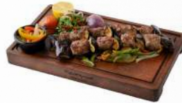
كباب بانجان Eggplants Kabab

Marinated & grilled half chicken served with French fries and our homemade garlic sauce