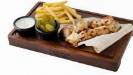
شيش طاووق Taouk

A selection of meat, Taouk, chicken kabab & Kafta grilled on skewers