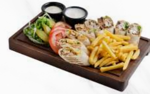
شاورما مشكلّة عربي Arabic Mixed Shawarma

with biwaz, tomato, Onion, parsley, and tarator sauce in Saj bread