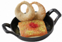
كنافة لبنانية بالجبن Lebanese Cheese Knefeh

Homemade special cake with Halawa topped with debes ice cream, and tahini