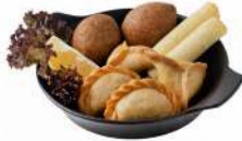
معجنات مشكله Assorted Lebanese Bites

Boiled chickpeas, Lemon juice & garlic mix, topped with olive oil, pines, and cumin