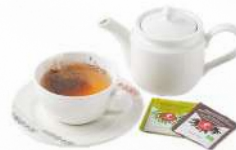
شاي اختيارك من النكهة Flavored Tea

All Prices are in AED and include VAT Charges