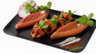
لوحه نية Law7a Nayeh

Raw meat Kebbeh, special Habib Beirut Sauce, truffle oil, and pistachio.