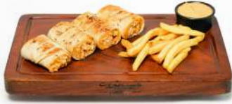
سندويش دجاج حبيب Habib Sandwich

Chicken shredded cooked, oriental burgul cooked, yoghurt, oriental sauce, and fried nuts.