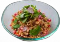
سلطة برغل Burgul Bi Remein salad

A mix of watermelon, shredded Greek Feta cheese, topped with black olives slices, mint leaves and basil leaves