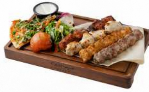
مشاويء مشكئة Mixed Grill

Veal fillet cubes marinated & grilled on skewers