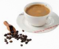
اسبريسو امريكانو Espresso Americano