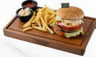
برغر لبنانية Lebanese Burger

Grilled chicken breast with spicy garlic sauce, pickles, and fries