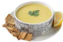
شوربة العدس Lentil Soup