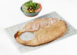
بالحوم والحبيش Halloumi and Turkey

A mix of Akkawi, Halloumi, Mozzarella, and Feta creamy cheese