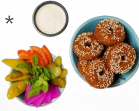
فلافل Falafel Platter

Traditional Falafel with parsley, radish, mint, turnip pickles flavored with our special tahini sauce