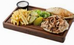
شاورما دجاج Chicken Shawarma Platter

Shawarma mix platter served with biwaz, tomato, onion, tarator, garlic paste, pickles, and fries