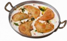
شيش برك سمك Shish Barak Samak

Meat kebbeh dough, stuffing mix cheese, pistachio crushed, and biwaz.