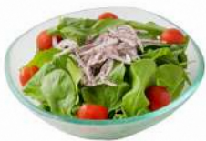
سلطة الروكا Rocket Salad

A mix of Romaine Lettuce, tomato, parsley, fresh mint, turnip pickles, cucumber pickles, and falafel balls, served with Tarator lemon oil dressing