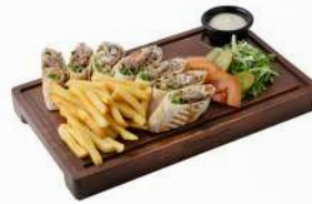
شاورما لحمة عربي Arabic Beef Shawarma

with lettuce, garlic paste, pickles, and french fries in Saj bread