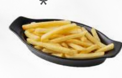
بطاطا مقلية French Fries

Fried cauliflower with sesame seeds, your choice of tahina sauce or pomegranate juice, oil, and chili paste