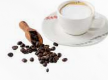
اسبريسو ماكياتو Espresso Macchiato