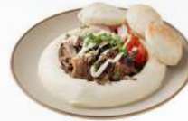
حمص بالشاورما لحم Hummus with Meat Shawarma

Traditional chickpeas dip with sesame paste, and olive oil topped with sliced chicken shawarma