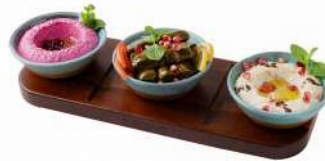
تشكيلة مازة حبيب Habib's Mezza Mix of 3

A choice of three items from the cold mezza list