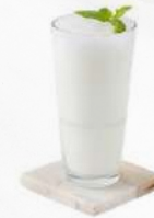
لبن عيران Laban Ayran

All Prices are in AED and include VAT Charges