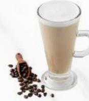
كافيه لاتييه Cafe Latte