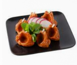
كبة نية أورفالية Kebbeh Orfaliyeh

Spicy mix of raw meat & wheat sprinkled with pines