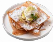
بودينغ بالزعفران Saffron Pudding

Pudding bread, caramelized banana, safron cream sauce, hazelnuts crumble.