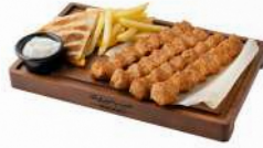
كباب الدجاج Chicken Kebab

Minced chicken breast with special herbs served with French fries