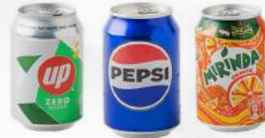
مشروبات غازية Soft Drinks