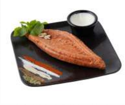
هبرة نية Raw Meat Tebleh