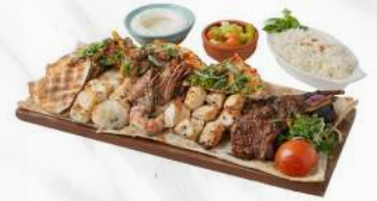
كيلو مشوي حبيب مشكل 1KG Habib Mixed Grill

A selection of meat, taouk, chicken kabab, arayess kafta, and kafta grilled on skewers