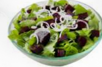
سلطة الشمندر Healthy Beetroot Salad

Our traditional tabbouleh with quinoa, pomegranate seeds, cucumber, chickpeas, green onion, and dried cranberry