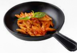
بينيه بصلصة الطماطم Penne Tomato / White Sauce

Tomato sauce, mozzarella cheese, and basil