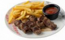
كفتة Kids Kafta

Beef patty with lettuce, tomatoes, served with fries, and ketchup