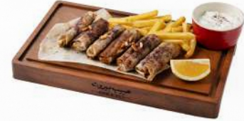
مسخن دجاج Mosakhan Saj

Burger Lebanese style made of freshly grilled meat topped with grilled tomato, and onion, french fries, coleslaw, and ketchup base sauce, served with a side of french fries, and coleslaw salad