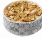
ام علي Oum Ali

Baked maamoul dough served with mohal-abiya, Vanilla Ice cream, and Ghazl el banet