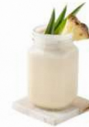
كولادا الاستوائية Tropical Colada