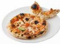
بيتزا مارغريتا Pizza Margherita

Grilled fingers of minced meat mixed with parsley, and onion, served with fries