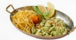
لحم بالحبق مع البطاطا Meat Pesto with Fries

A Bowl of Hummus Paste Topped with a Combination of Sojok, Tomato Sauce, Green and Red Bell Peppers