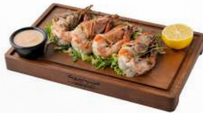
قريدس مشويء Grilled Jumbo Shrimps

Chicken chunks marinated in lemon juice & garlic served on skewers with Habib tasty garlic sauce, and French fries