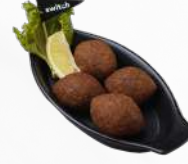
كبة مقلية Stuffed kebbeh Balls

Deep-fried pastries stuffed with Switch™ minced meat, onions, and pine nuts