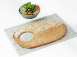
كعكة الاربع اجبان Four Cheese

Melted white cheese served with side vegetables