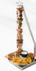
دجاج مشويء عالسيخ Chicken skewers

Chicken chunks marinated in lemon juice & garlic served on skewers with Habib tasty garlic sauce, french fries and grilled vegetables