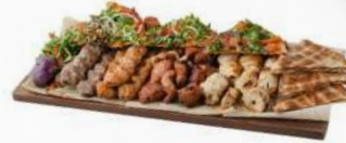
كيلو مشوي مشكل 1KG Mixed Grill

Kebab with eggplants, tomatoes, and Green & Red Bell Pepper