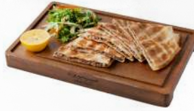
عرايس باللحمة Meat Arayes

Marinated grilled jumbo shrimps served with our special cocktail sauce