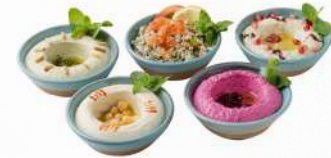
صينية مازة حبيب Habib's Mezza tray

A choice of three items from the cold mezza list