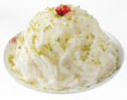
ميّل يا غزيريل Mayel Ya Ghzayyel

Crispy vermicelli filled with Lebanese cream served with sugar syrup