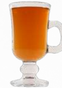
زهورات Lebanese Zhourat