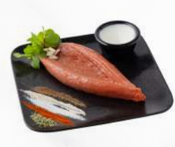
كبة نية Raw Meat Kebbeh

Spicy mix of raw meat & wheat sprinkled with pines