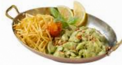
دجاج بالحبق والبطاطا Chicken Pesto with Shoestring fries

Baked dough stuffed with spinach, onions, and sumac