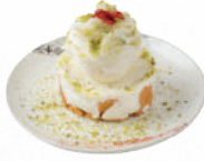
معمول بالفزل Maamoul Bel Ghazal

Baked maamoul dough served with mohal-abiya, Vanilla Ice cream, and Ghazl el banet