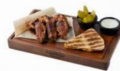
جوانح الدجاج Chicken Wings

Chicken livers sautéed in pomegranate syrup