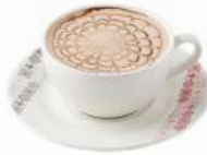
شكولاته ساخنة Hot Chocolate