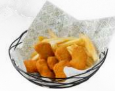
دجاج الناغتس Chicken Nuggets

Fried chicken nuggets served with cocktail sauce, and fries