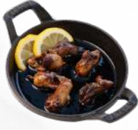
عصافير (عدد ٦) Birds (6 Pieces)

Pan fried clean birds, served in Molasses sauce