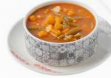
شوربة الخضار Vegetable Soup

Chickpea-yogurt dish with authentic pita bread sautéed pine nuts, and a hint of garlic