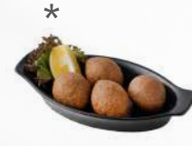
كبة مقلية Stuffed kebbeh Balls

Deep-fried pastries stuffed with minced meat, onions, and pine nuts