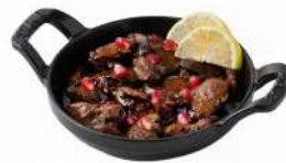
كبدة الدجاج Chicken Liver

A combination of cheese roll, sambousik, fried kebbeh, and spinach fatayer