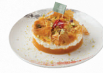
عثمالية ام حبيب Em Habib Osmaliyeh

Sweet made of puff pastry milk, and nuts