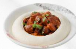
حمص بالسجق Hummus Soujok

Hummus with cauliflower served with hot sauce