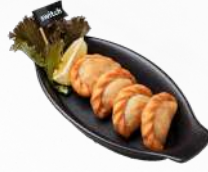
سمبوسك لحمية Sambousik

A bowl of Hummus topped with Switch™ minced meat, and pine nuts