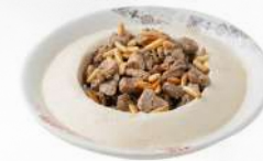
حمص باللحم والصنوبر Hummus with Meat and Pine Nuts

Traditional chickpeas dip with sesame paste topped with slices of meat shawarma, grilled onion, and tomato