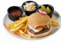
برغر صغير Mini Burger

Deep-fried breaded taouk served with fries and cocktail sauce