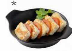
جينة الحلوم المشوية Grilled Halloumi

A mix of cooked fava bean, chickpeas, garlic, and lemon juice