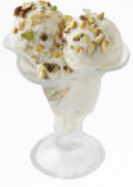
بوظة Ice cream 3 scoops

Discover the rich flavors of Lebanese ice cream Chocolate, Vanilla Strawberry, Carob, Mastic, Ward (Rose), Pistachio