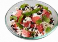
سلطة بطيخ Watermelon Feta Salad

A refreshing mix of greens, tomato, sumac and toasted pita croutons, with pomegranate dressing