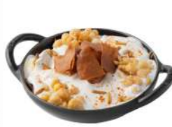
فتة حمص Hummus Fatteh

Grilled chicken slices & chickpeas, smothered with warm yogurt & topped with fried bread, and pine nuts