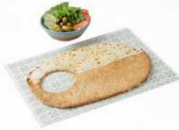
بالجبنة العكاوي Akkawi Cheese

Melted white cheese served with side vegetables