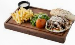
شاورما لحمة Beef Shawarma Platter

Chicken shawarma with lettuce, garlic, pickles, and french fries