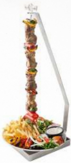
كباب مشويء عالسيخ Grilled Kabab Skewers

A selection of Taouk, fish skewers, lamb cutlets, arayes kafta