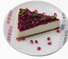
شيز كايك رمان Remein Cheese Cake

Discover the rich flavors of Lebanese ice cream Chocolate, Vanilla Strawberry, Carob, Mastic, Ward (Rose), Pistachio