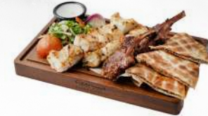
مشاويء حبيب مشكئة Habib Mixed grill

Grilled Arabic bread stuffed with minced meat, and parsleys