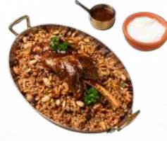
برغل باللحم Burgul 3a Lahme

Pan fried beef steak, entrecote beirut sauce, and french fries.