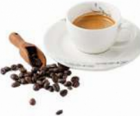
اسبريسو دوبيو Espresso Doppio