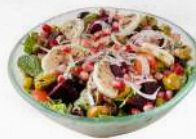
سلطة حبيب Habib's Fresh Salad

A mix of Eggplant, rocca leaves, watercress, zaatar fresh, salt, pepper, white onion, pomegranate seeds, pomegranate molasses, sumac, yoghurt mint sauce.