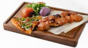
لحمة مشوية Meat Skewers

Grilled lamb with nuts and cheese served on skewers with french fries and grilled vegetables