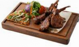
كستلاته غنم مشوي Lamb Cutlets