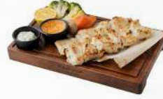
سمك بالسيخ Fish Skewers

Minced chicken breast with special herbs served with French fries