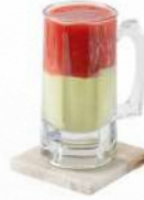
أفوكادو فراولة Avocado strawberry