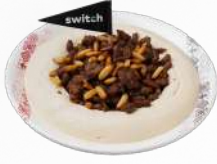
حمص باللحم والصنوبر Hummus with Meat and Pine Nuts

A bowl of Hummus topped with Switch™ minced meat, and pine nuts