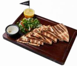
عرايس باللحمة Meat Arayes

Crispy meat and bulgur shell stuffed with a delicious filling of Switch™ minced meat, pine nuts, and crushed wheat