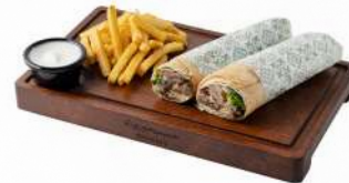
شاورما لحمة Beef Shawarma

Chicken shawarma with lettuce, Garlic, pickles, and French fries