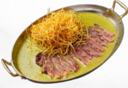
لحمة ستيك مع اونتروكوت بيروت صوص Café Meat Beirut

Pan fried beef steak, entrecote beirut sauce, and french fries.