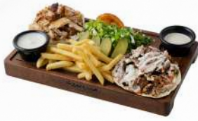
شاورما مشكلّة Mix Shawarma Platter

Shawarma mix platter served with biwaz, tomato, onion, tarator, garlic paste, pickles, and fries