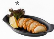
سمبوسك لحمه Sambousik

White cheese with a touch of parsley wrapped in thin dough