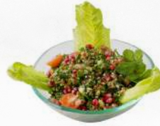
كينوا تبولة Quinoa Tabbouleh

A mix of Burgul, mint leaves, dry cranberry, red onion, garlic fresh, chopped mint, chopped parsley, lemon juice, hounsroum molasses, pomegranate molasses, red radish, and dry raisin.