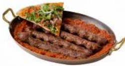
كباب خشكاش Kebab Keshkash

A selection of taouk, fish skewers, shrimp, lamb cutlets, and arayess kafta