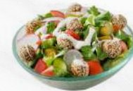
سلطة فلافل Falafel Salad

Variety of greens, beetroot, & vegetables, with black and green olives from lebanon's mountains