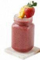
اكاي البرازيليه Brazilian Acai